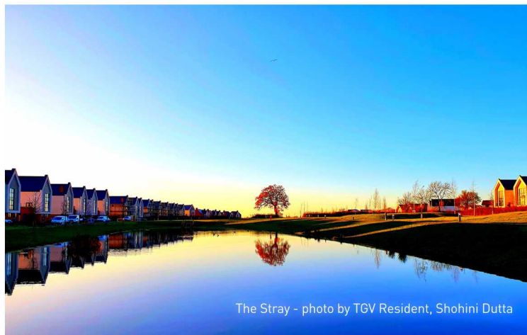
The Stray