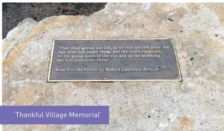
'Thankful Village Memorial'