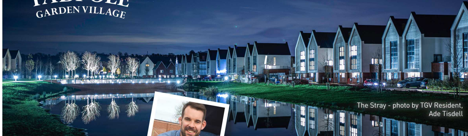
The Stray